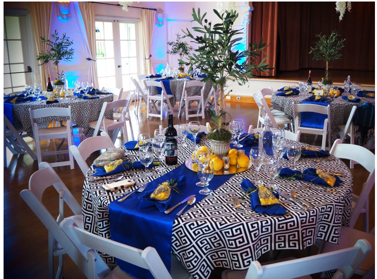
The beautiful Greek décor at the Supper Club